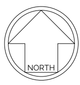
Fig 5 Land Ownership