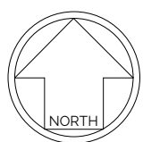
Fig 6 Proposal Options