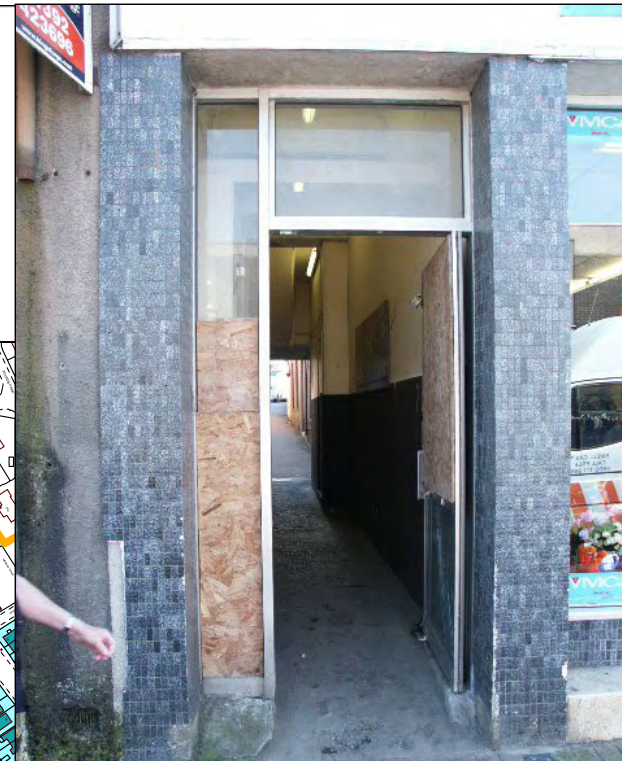
Alleyways and opes should be upgraded to encourage use and improve connectivity.