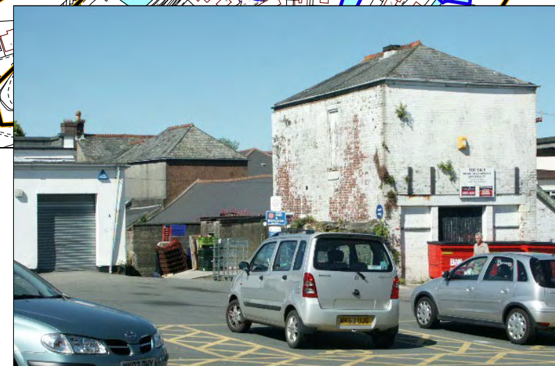
The redundant buildings behind Fore Street present an opportunity for regeneration.