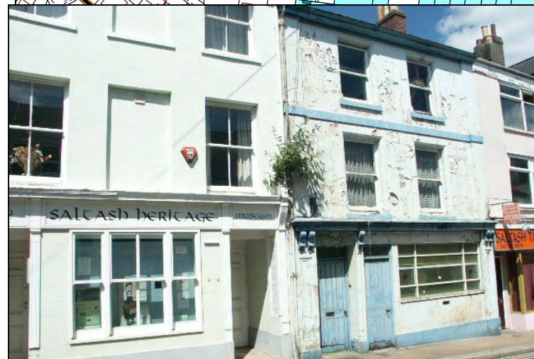
A grant scheme in Lower Fore Street would encourage the restoration of the historic buildings and their reuse.