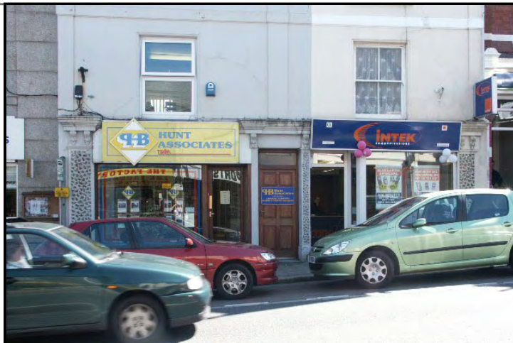
Historic shopfronts existing behind inappropriate modern replacements should be restored.