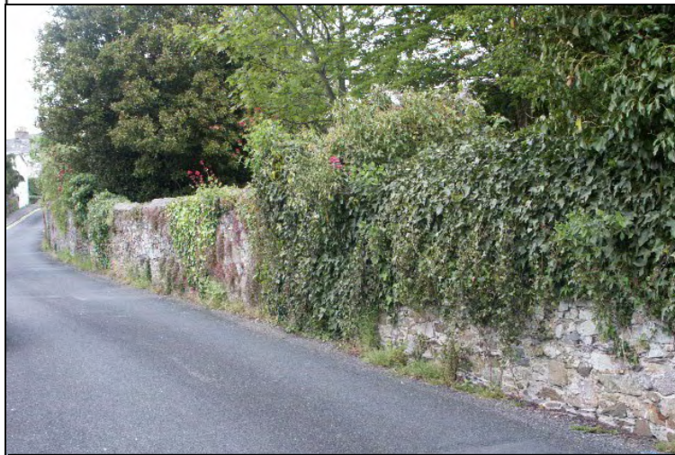
Walls and outbuildings should be protected as they contribute to the overall character of the area.