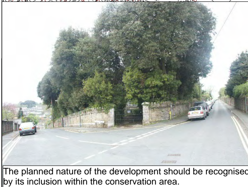
The planned nature of the development should be recognised by its inclusion within the conservation area.