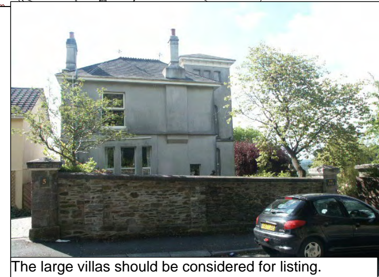
The large villas should be considered for listing.