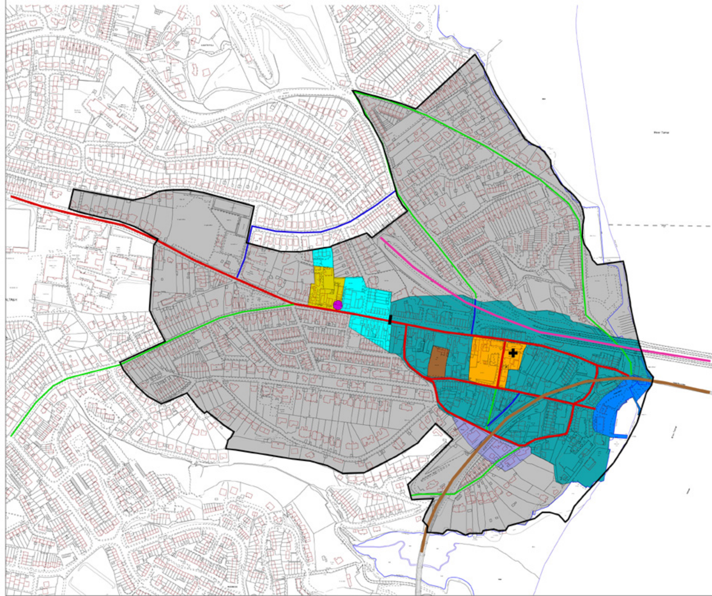
Figure 4. Historic settlement topography