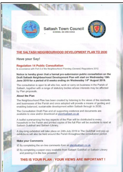
Figure 7: 'Advert placed in 'LoveSaltash'