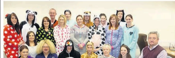
Figure 1: Saltash Observer for April 2013

4.3 The Steering Group also created a website , a Facebook site and a Twitter account to engage with local people and encourage them to visit the website at key points. These included the initial consultation about the shape of the plan and feedback on the results, recruitment for the working groups, questions on specific topics identified by the working groups, awareness raising in the run up to the formal consultation on the plan, and the formal consultation itself.