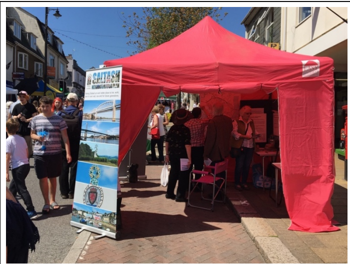
Photo: 13. May Fayre street stand 2018.

6.1 During the period when the NDP was held, it was thought appropriate to remind the community about its role and help to differentiate it from the DPD, so a staffed 'gazebo' stand was set up at the May Fayre event on Saltash Fore Street for this purpose.