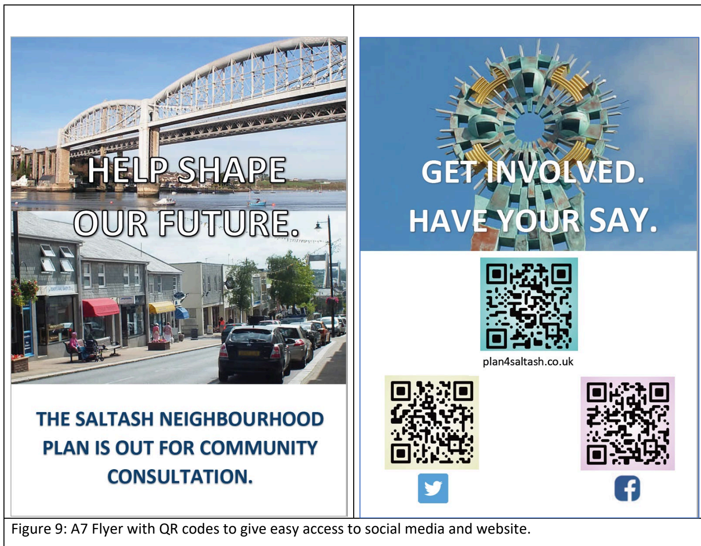
Figure 9: A7 Flyer with QR codes to give easy access to social media and website.

6.6 In addition, an A7 Flyer was produced for distribution at events and generally around the town. This included QR codes so that recipients could use their mobile phones to access the NDP Website, Twitter and Facebook accounts.