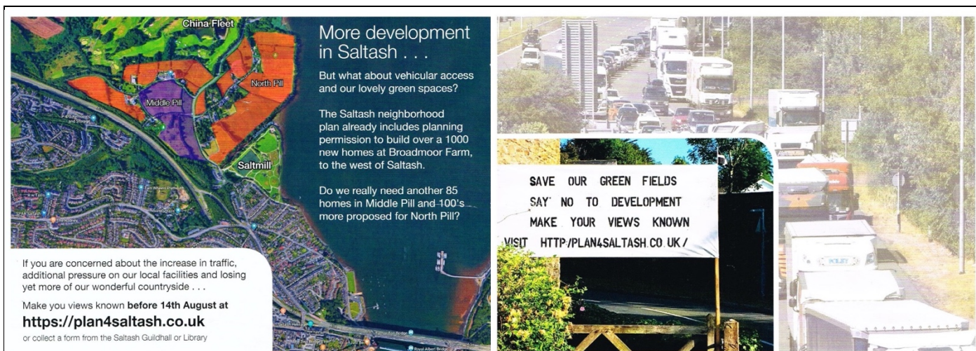
Figure 10: Misleading flyer anonymously circulated at the time of the R14 Consultation.

6.11 Unfortunately, despite the efforts made by the Steering Group to avoid confusion between the DPD and the NDP, and the presence of the North and Middle Pill Residents Association on the Steering Group, a flyer was widely circulated around the town which implied that the NDP included proposals to allocate land for 85 dwellings in Middle Pill [this is an allocation in the DPD] and hundreds more in North Pill, along with a map showing a large area of land shaded in purple and orange that looked like it may be an extract from an official document such as the NDP (See Figure 10 for copy of the flyer).