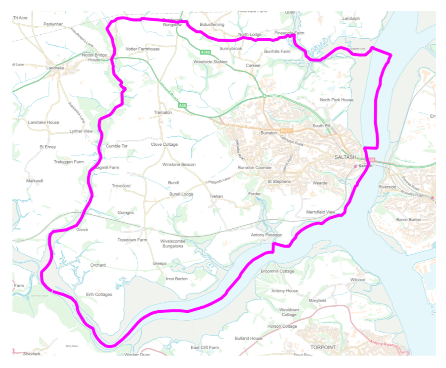
Figure 1: The Saltash NDP Designated Area.